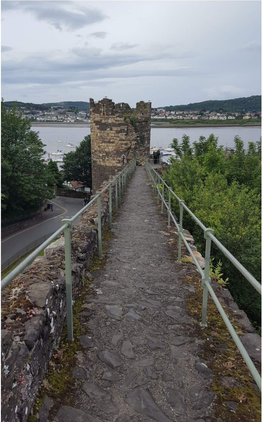
Conwy Town Walls, photo by Diane Jeffer, 2019