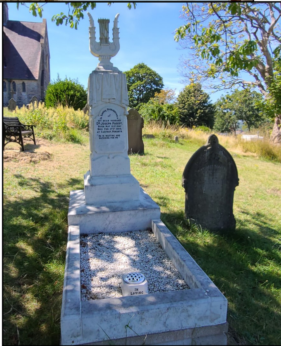
Right: Dr. Joseph Parry family grave, St. Augustine's churchyard, Penarth