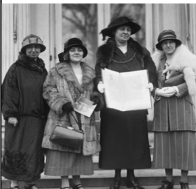
1924 Peace Petition delegation

Hidden History www.welshwne.org/events/hidden-history-event