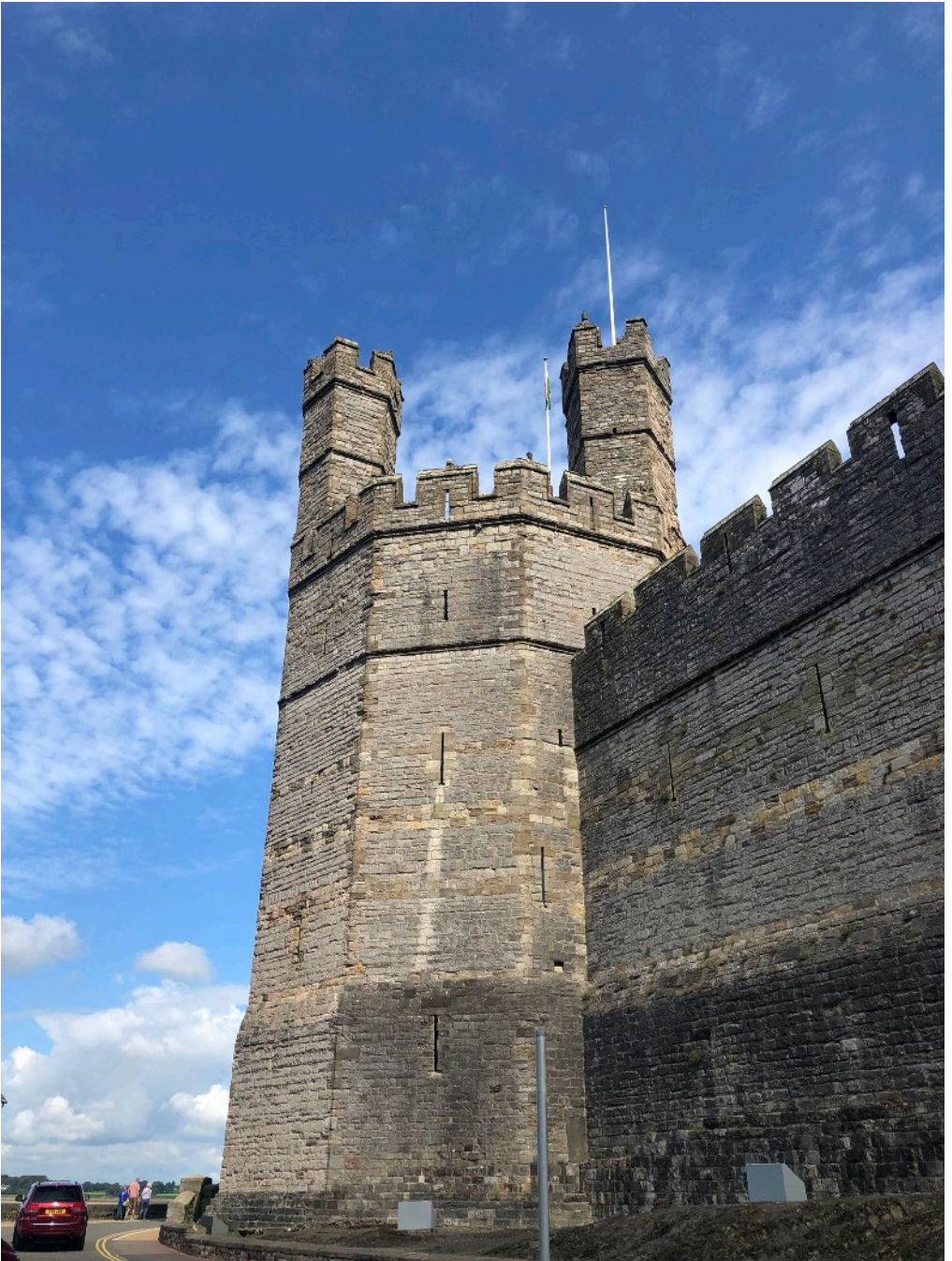
Castell Caernarfon Castle