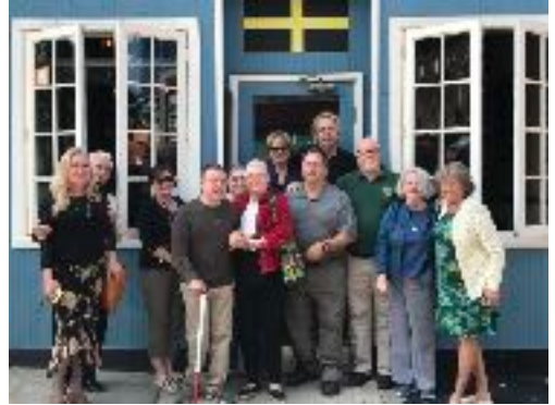
Friends and members of WSWNE at the Sunken Hundred, NYC